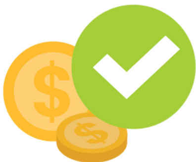
Table for ambulance costs Costs for ambulances will change every year.